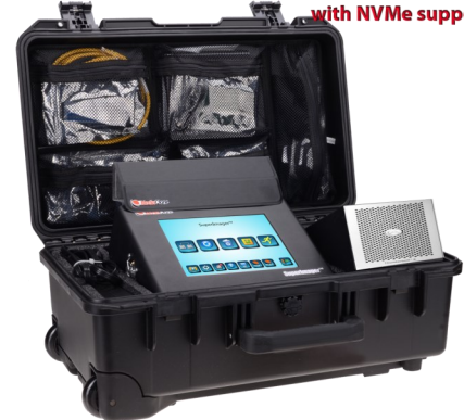
Thunderbolt 3.0 Port & PCIe 3.0 Expansion Box with NVMe supports